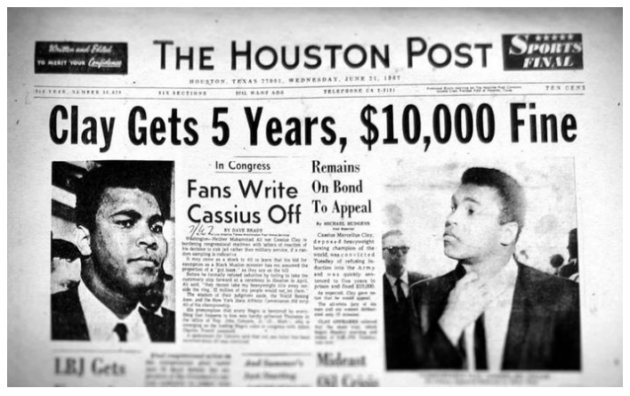
Source: Vice Media LLC, Fightland Blog, <u>The Draft Dodger: Ali's Fight Against an Unjust War and the Country that Waged It</u>. Front page of the Houston Chronicle, June 21, 1967.

On June 20, 1967, at a federal court in Houston, an <u>all-white jury</u> found Ali guilty of "wil[I]fully refusing to be inducted into the Armed Forces of the United States" <sup>10</sup> after <u>deliberating for 21 minutes</u>. The presiding judge imposed the <u>maximum penalty: five years' imprisonment and a $10,000 fine</u>. In addition, the judge ordered Ali to surrender his passport pending appeal—<u>the State Department and FBI deemed Ali a flight risk</u>—depriving Ali of the ability to box abroad.