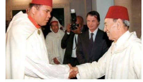
Source: Morocco World News, <u>When Muhammad</u> <u>Ali Was Decorated by King Hassan II</u>. Muhammad Ali with King Hassan II Morocco in 1988.

'Without his gloves on, Ali is just another demagogue and an apologist for his so-called religion, and his views on Vietnam don't deserve rebuttal . . . It is, of course, purposeless to dwell on the good Ali could have done for black and white alike if he hadn't aligned himself with the Muslims. But if indeed he does go to jail, Ali can achieve the martyrdom he seeks only if it is shown that he is sacrificing himself for the sake of a principle worthy of the name.'"16